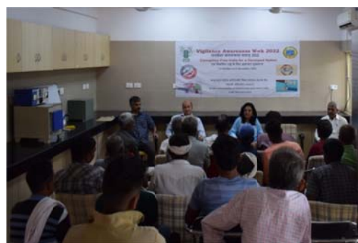
Fig.2. Awareness program involving villagers