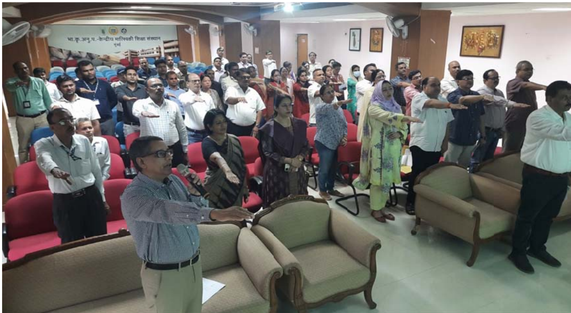
Fig.1. Staff, Officials and Scientists of ICAR-CIFE taking the pledge