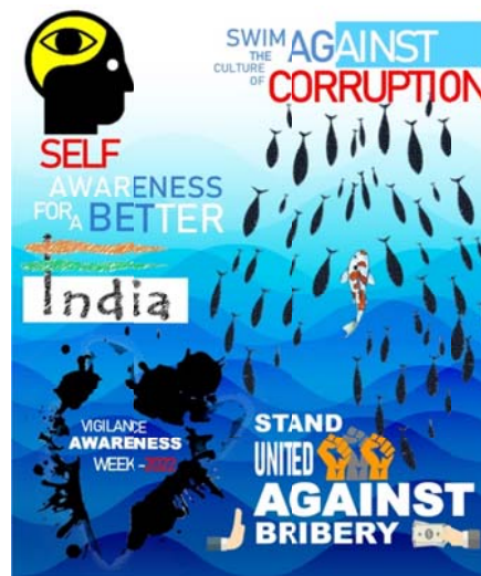
Fig.2. Second Prize winning Poster