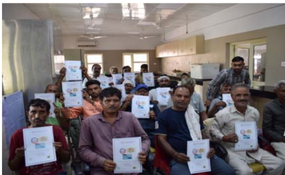
Fig.3. Vigilance Awareness program for the staff