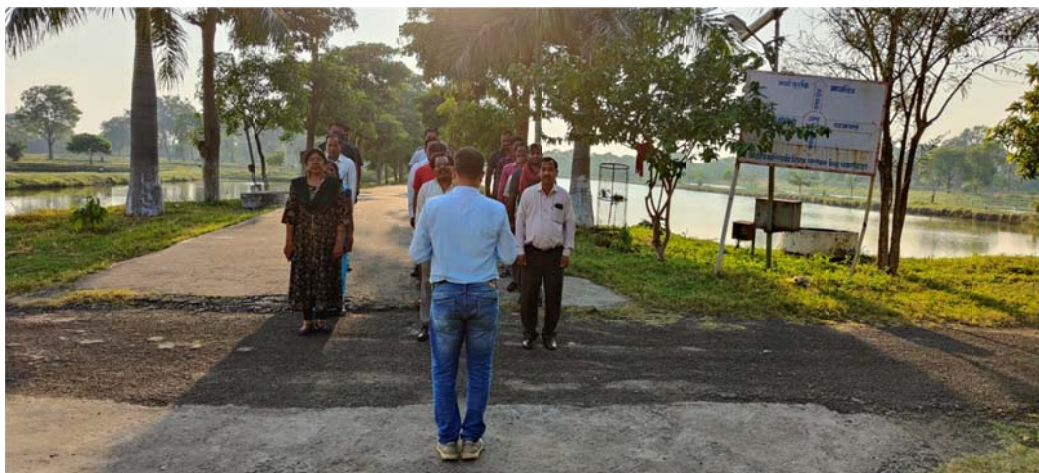
Fig.1. Vigilance awareness integrity pledge at Powarkheda centre, Narmadapuram, Madhya Pradesh

Vigilance awareness week was celebrated at ICAR-CIFE, Powarkheda centre, Narmadapuram, Madhya Pradesh on 31 st October to 06 November, 2022. All staff of the centre took Integrity pledge as citizen of India on 31/11/2022. A group discussion was held on Vigilance awareness. Official and contractual staffs were educated on the issue of corruption and right to report on corruption etc. on 06/11/2022.