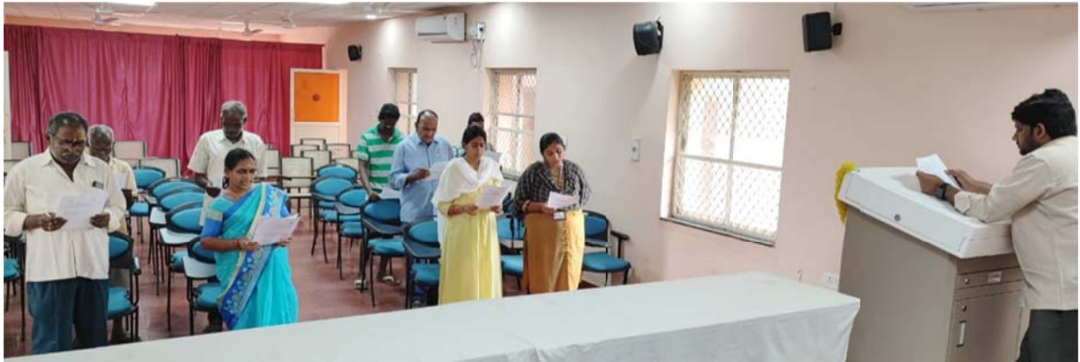
Fig.1. Vigilance awareness integrity pledge at BWFF of ICAR-CIFE, Kakinada Centre

Vigilance awareness week was observed by taking an integrity pledge on 31.10.2022 at both the farms Brackishwater Fish Farm, Kakinada and Freshwater fish farm, Balabhadrapuram of ICAR-CIFE, Kakinada Centre. Banners on vigilance awareness week-2022 were displayed at both the farms. Pamphlets were distributed to create awareness on the integrity.