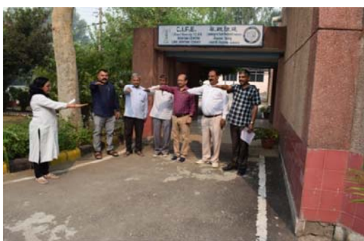
Fig.1. Vigilance awareness integrity pledge at the Rohtak Centre

Vigilance Awareness Week was celebrated at the Rohtak Centre from 31 st October to 6 th November 2022 with the theme of “Corruption-free India for a developed nation”. A pledge was administered to all officials and staff. Following this, all official staff, contractual staff, and a group of people from nearby local villages were assembled in the office and made aware of the importance of the commitment to the highest standards of honesty and integrity for the benefit and progress of the country. The staff and village people also deliberated various topics in this regard and an initiative has been made to bring an end to corruption by raising their voices against corruption and bringing awareness among the citizens to understand the cause of corruption and stand against it.