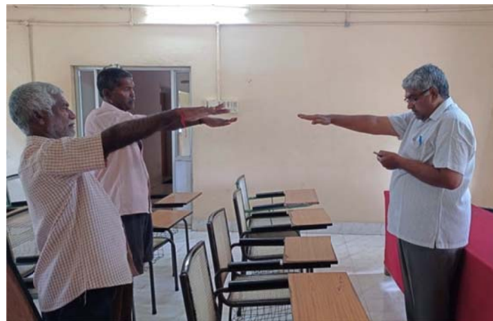
Fig.2. Vigilance Awareness integrity pledge at FWFF, Balabhadrapuram